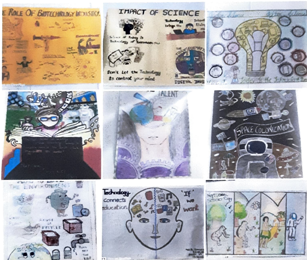
Figure: Poster presentation of the Event