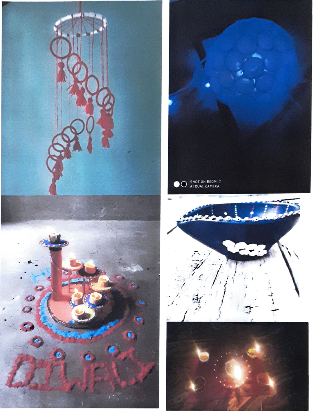
Figure: Diwali celebration