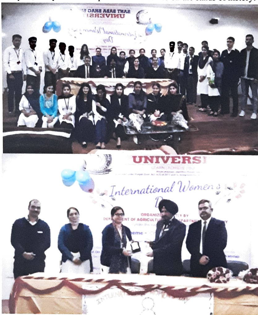
Figure: Glimpses of International Women's Day