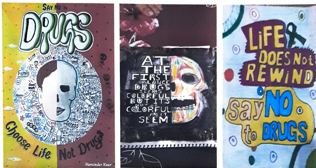
Figure: Photographs of the event

International Day Against Drug Abuse and Illicit Trafficking is celebrated as against drug abuse and the illegal drug trade. The event of slogan writing and poster presentation competition via online mode was conducted in association with Red Ribbon club. The theme of the event was Better Knowledge for Better Care. The students of the various departments of university have enthusiastically contributed through online mode. More than 50 entries were received under both the activities. Students delivered impactful messages against the use of drugs through their posters and slogans. Result was declared on the same day.